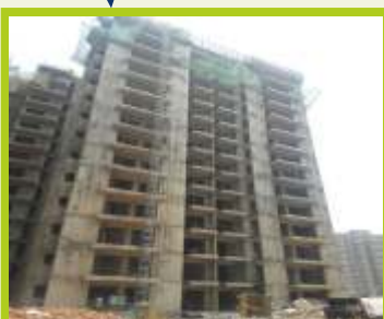
Super structure completed Interior plaster work completed