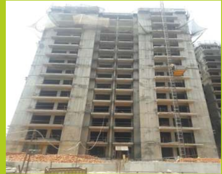
TOWER L April 2016 Super Structure completed Interior plaster work under progress