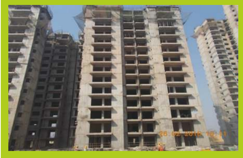
TOWER D February 2016 Super Structure completed Interior plaster work completed