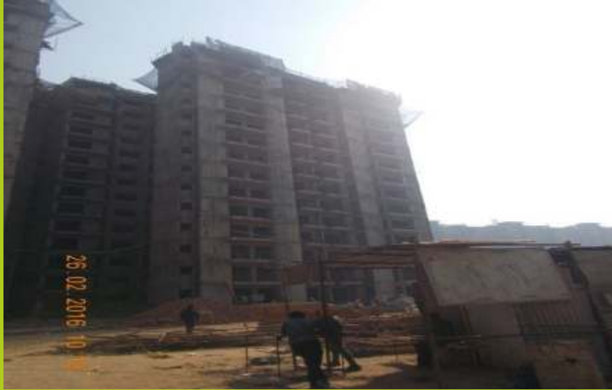
TOWER L February 2016 Super Structure completed Interior plaster work under progress