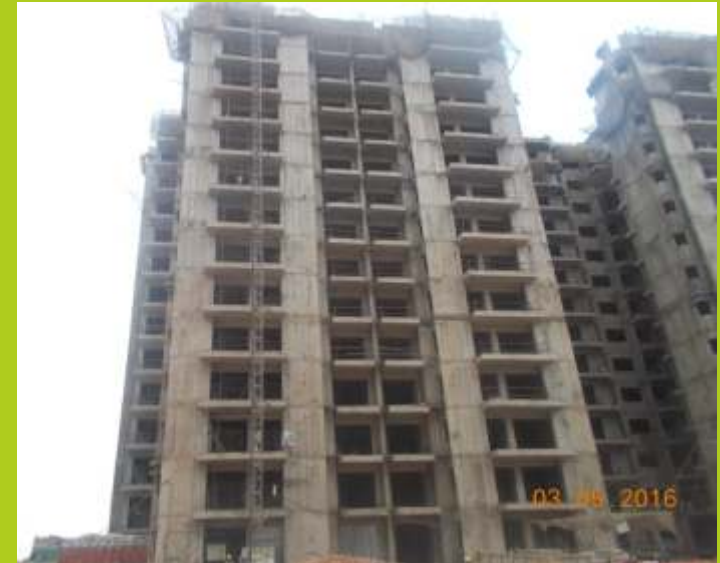
TOWER K April 2016 Super Structure completed Interior plaster work under progress Inside your World: Internal Plumbing Works - 1st floor to 3rd floor completed