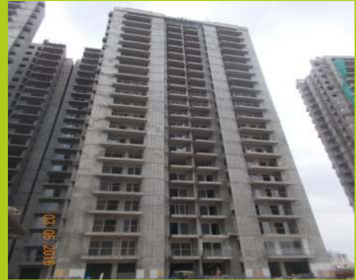
TOWER F April 2016 Super Structure completed Interior plaster work completed Interior finishing work under progress Inside your World: Italian Marble - 1st floor to 9th floor completed Tile Works - 1st floor to 21st floor completed Internal Electrical Works - 1st floor to 17th floor completed Internal Plumbing Works - 1st floor to 21st floor completed