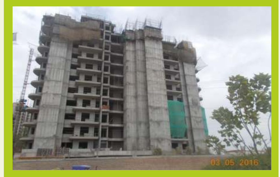
TOWER A April 2016 11th floor slab 50% completed