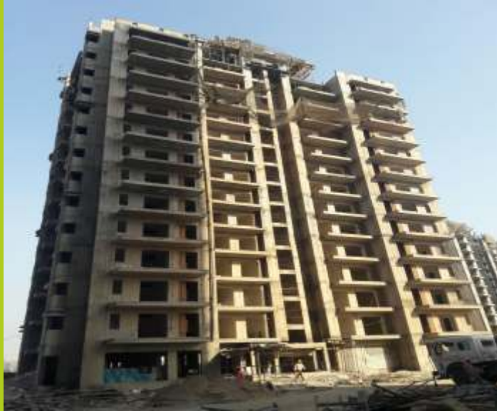
TOWER I February 2016 Super Structure completed Interior plaster work under progress