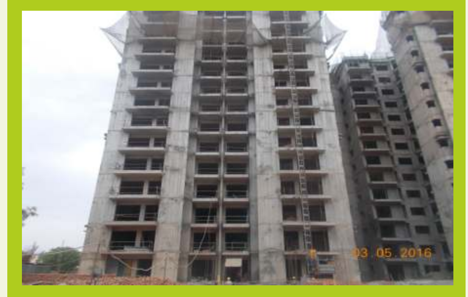
TOWER C April 2016 Super Structure completed Interior plaster work under progress