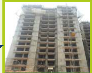
Super Structure completed Interior plaster work under progress