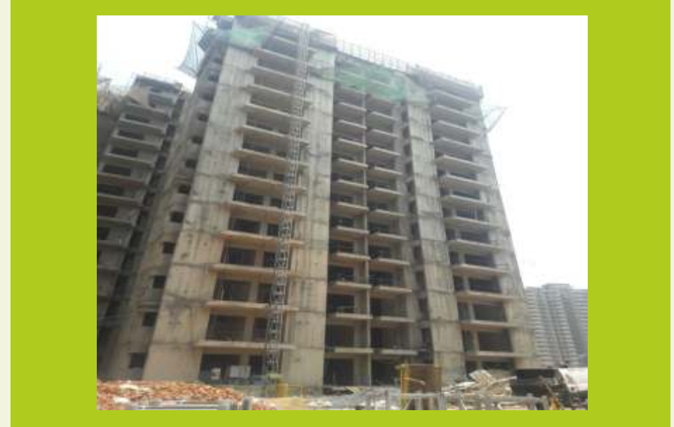
TOWER D April 2016 Super Structure completed Interior plaster work completed

Inside your World: Tile Works - 1st floor to 4th floor completed Internal Plumbing Works - 1st floor to 7th floor completed