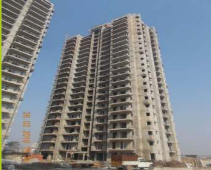
TOWER H February 2016 Super Structure completed Interior plaster work completed Interior finishing work under progress