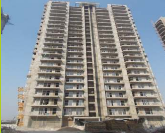
TOWER G February 2016 Super Structure completed Interior plaster work completed Interior finishing work under progress