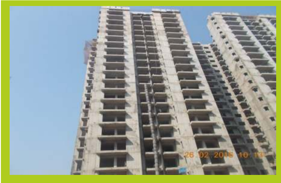
TOWER E February 2016 Super Structure completed Interior plaster work under progress Interior finishing work under progress