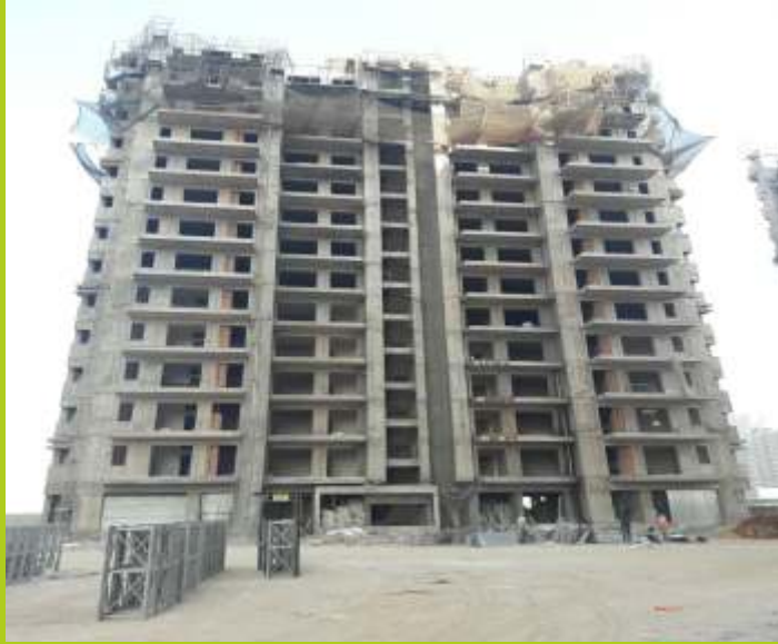
TOWER J February 2016 Super Structure completed Interior plaster work under progress Interior finishing work under progress