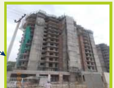
Super Structure completed Interior plaster work under progress