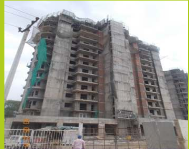
TOWER B April 2016 Super Structure completed Interior plaster work under progress