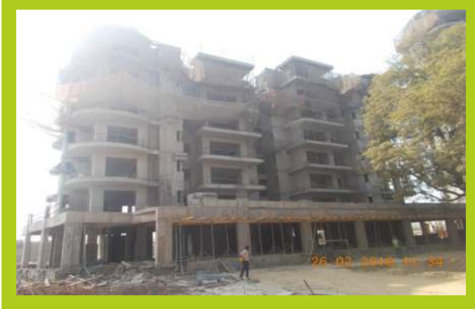
TOWER A February 2016 7th floor slab 40% completed