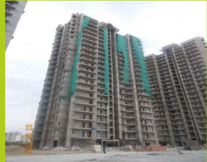
TOWER G April 2016 Super Structure completed Interior plaster work completed Interior finishing work under progress