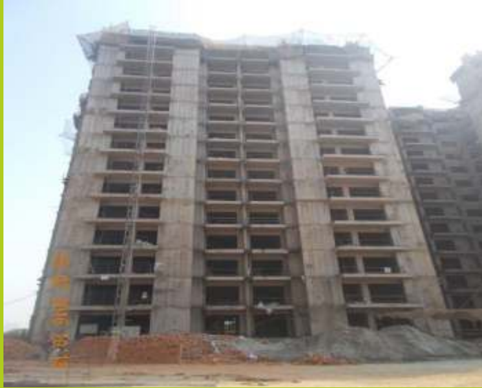
TOWER K February 2016 Roof floor slab completed Interior plaster work under progress