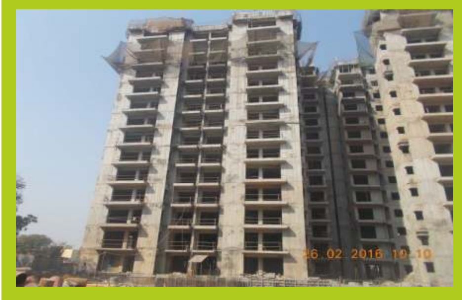
TOWER C February 2016 Roof floor slab completed