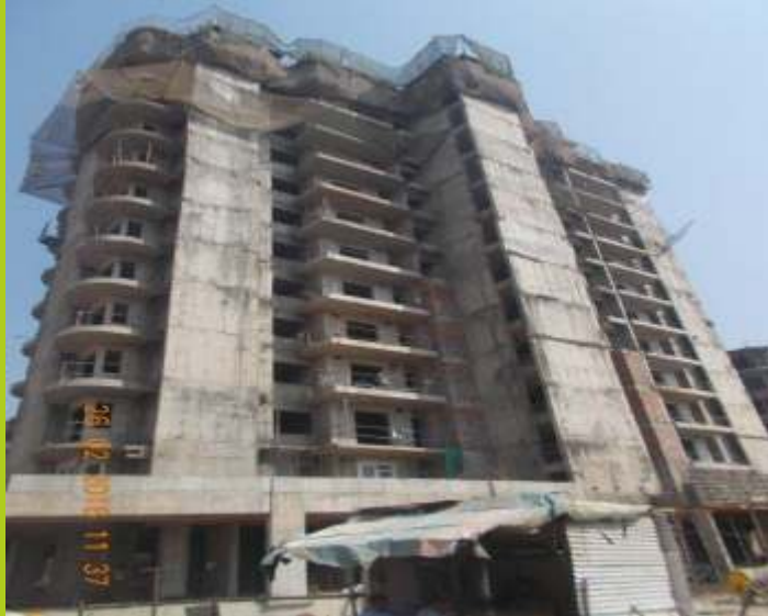
TOWER B February 2016 13th floor slab completed