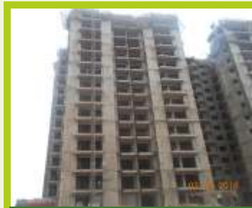
Super Structure completed Interior plaster work under progress