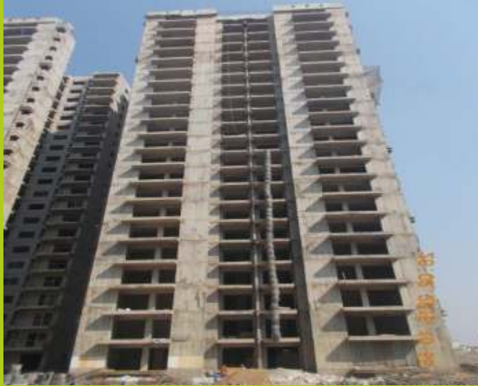
TOWER F February 2016 Super Structure completed Interior plaster work under progress Interior finishing work under progress