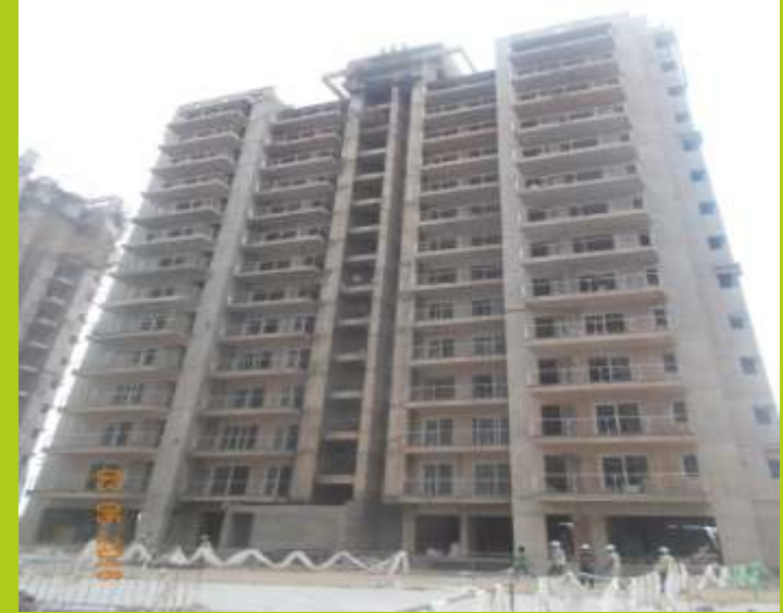
TOWER J April 2016 Super Structure completed Interior plaster work completed Interior finishing work under progress

Inside your World: Italian Marble - 1st floor to 10th floor completed Tile Works - 1st floor to 13th floor completed Internal Electrical Works - 1st floor to 13th floor completed Internal Plumbing Works - 1st floor to 13th floor completed Washroom False Ceiling - 1st to 7th floor completed