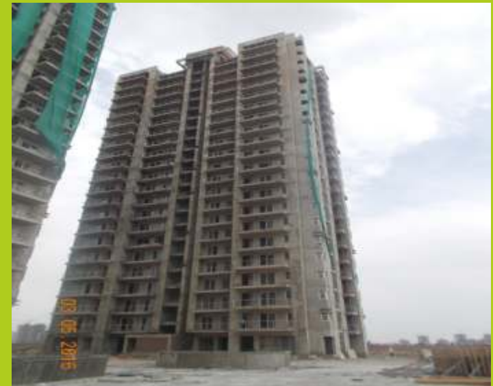
TOWER H April 2016 Super Structure completed Interior plaster work completed Interior finishing work under progress Inside your World: Italian Marble - 1st floor to 18th floor completed Tile Works - 1st floor to 21st floor completed Internal Electrical Works - 1st floor to 17th floor completed Internal Plumbing Works - 1st floor to 21st floor completed Washroom Counters - 1st floor completed