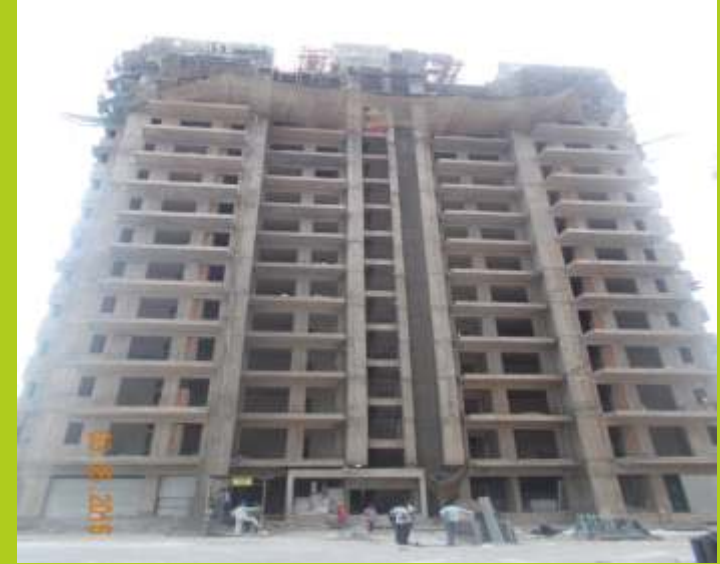
TOWER I April 2016 Super Structure completed Interior plaster work completed

Inside your World: Tile Works - 1st floor to 10th floor completed Internal Plumbing Works - 1st floor to 13th floor completed