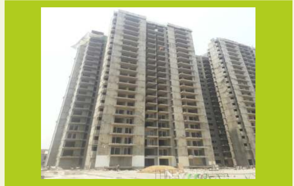
TOWER E April 2016 Super Structure completed Interior plaster work completed Interior finishing work under progress Inside your World: Italian Marble - 1st floor to 3rd floor completed Tile Works - 1st floor to 19th floor completed Internal Electrical Works - 1st floor to 5th floor completed Internal Plumbing Works - 1st floor to 21st floor completed