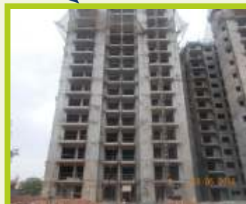
Super Structure completed Interior plaster work under progress